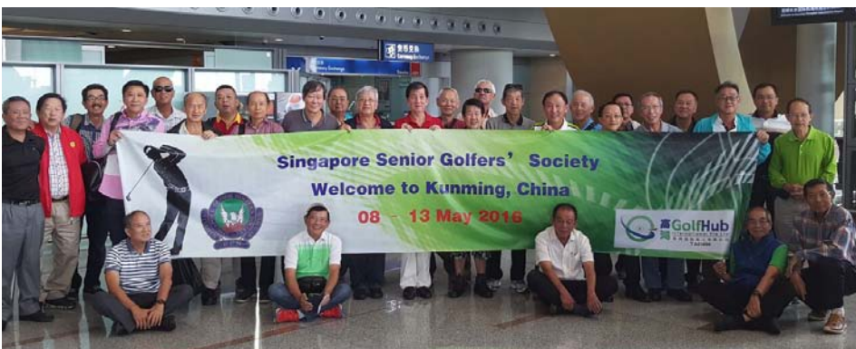
Arrival at Kunming Airport