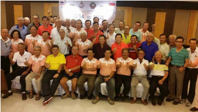
TSGA and SSGS members at dinner at Lotus Valley Golf Club

On arrival, they played at Royal Gems Golf City Club before proceeding to check into Imperial Pattaya Hotel. The next 2 days, they played in Siam Country Club & Laem Chabang International Golf Club in Pattaya before taking a rest day in Bangkok.