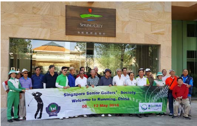
At Spring City Golf and Lake Resort - we are ready for the game!

The five rounds of golf were memorable and members rekindled their friendship and bonding as they continued to reminisce and relive their golfing feats on the way back to Singapore.