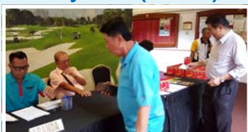
Members registering for the February medal at OCC