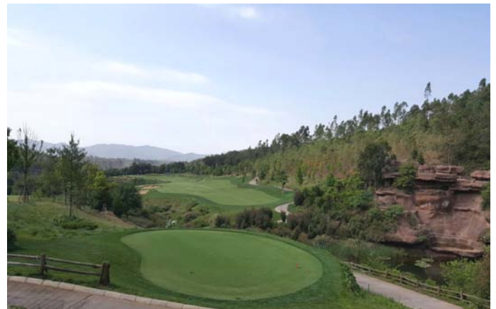
The picturesque view from Tee Box 17 at Lakewood Golf Course