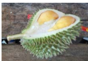
At the Bao Sheng Durian Farm... so shiok!!

At Kek Lok Si Temple which showcased the tallest statue of the Goddess of Mercy in South East Asia, it was an arduous climb on foot to the top! The views of Penang island were priceless at the peak but for some of us, the highlight was the famous Penang assam laksa that we ate at the base of the site.