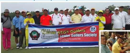
Cheerful group picture upon arrival at the Tering Bay Golf Resort, Batam