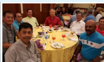
Members enjoying dinner after the medal at JCC