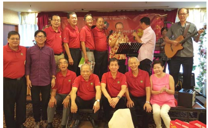
Dr Tan Cheng Bock (Back row, 3 rd from right) with members of SSGS General Committee and The Music Mix Band

This year the Society continued our tradition of hosting a community service lunch to celebrate Lunar New Year. On 24 February, 30 residents from the St. John's Home for Elderly Persons were invited to the lunch party held at Ah Yat Seafood Restaurant in Turf City.