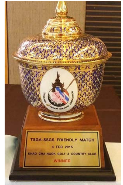
TSGA vs SSGS Challenge Trophy

On Day 5, the group met their Thai counterparts for the Annual Inter-port Challenge held at Lotus Valley Golf Club in Bangkok. The Singapore team lost to their hosts by a wide margin. Good camaraderie and friendship took precedence at dinner, with all participants enjoying the delicious Thai food and warm hospitality.