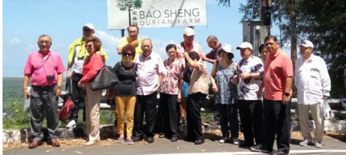
We have arrived for our Makan Trail!