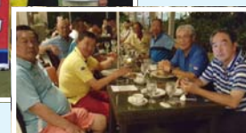
BBQ dinner at Batam View Resort